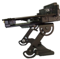
Desk Mount (Elevated)